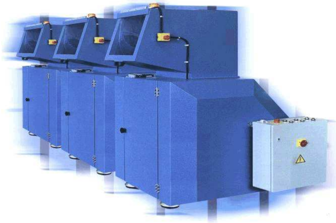
SML 35/42 C with manual feed hopper