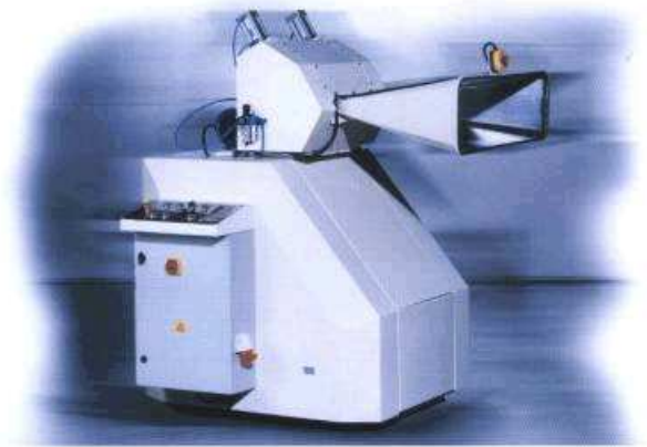
SML 35/42 with integrated sound proofing, roller feeding device and gathering hopper