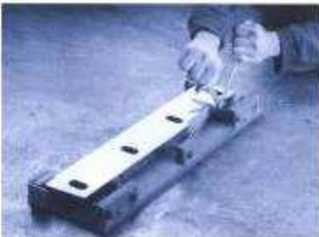
Adjustment fixture to pre-adjust the cutters outside of the machine