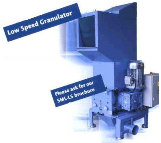
The SML granulator series exists as well as low-speed granulators (SML-LS).