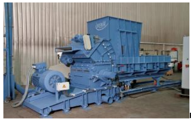
Fig.3:SML 60 /100 HB

Now it is possible in one single size reduction step with the HERBOLD granulator of the HB series. The design of the HERBOLD HB granulator is a combination of a feed hopper and a hydraulic ram with a granulator. Due to the special design of the grinding chamber and the high cutting frequency, it is now possible to transform bales, cut open film rolls, mingled packs of sprue spiders, but also extremely large and thick-walled purgings into the finished product in one single step.