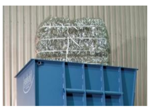
Fig.5: Film bales

The main advantage of this new development is its space-saving design since only one size-reduction step is necessary. In addition, only one size-reduction step also makes cleaning and colour and material changes much easier: there is no problematic and difficult to clean intermediate conveying by means of a belt conveyor. Only one machine will need knife change and maintenance, thus reducing maintenance times and costs. Compared to a two-step solution and a granulator fed by gravity, it has also a considerably favourable effect on the energy balance.