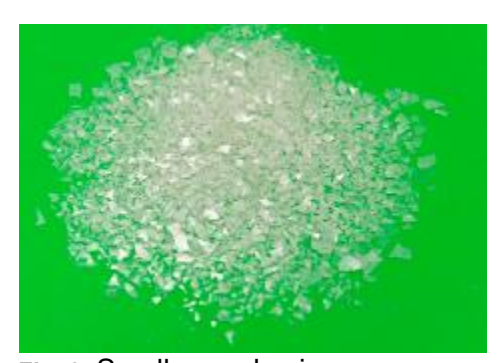
Fig. 2: Small granule size

Now it is possible in one single size reduction step with the HERBOLD granulator of the HB series. The design of the HERBOLD HB granulator is a combination of a feed hopper and a hydraulic ram with a granulator. Due to the special design of the grinding chamber and the high cutting frequency, it is now possible to transform bales, cut open film rolls, mingled packs of sprue spiders, but also extremely large and thick-walled purgings into the finished product in one single step.