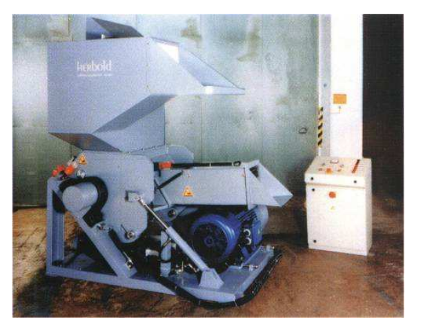
SMP 45/70 with horizontal feed trough and additional feed hopper, without sound proofing

Herbold pipe granulator type SMP 22/30 EV with roller feed device and horizontal feed channel, fully sound proofed